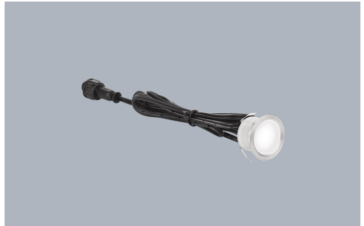
M-Lite™ IP67 LED Deck Light 6 Pack Kit