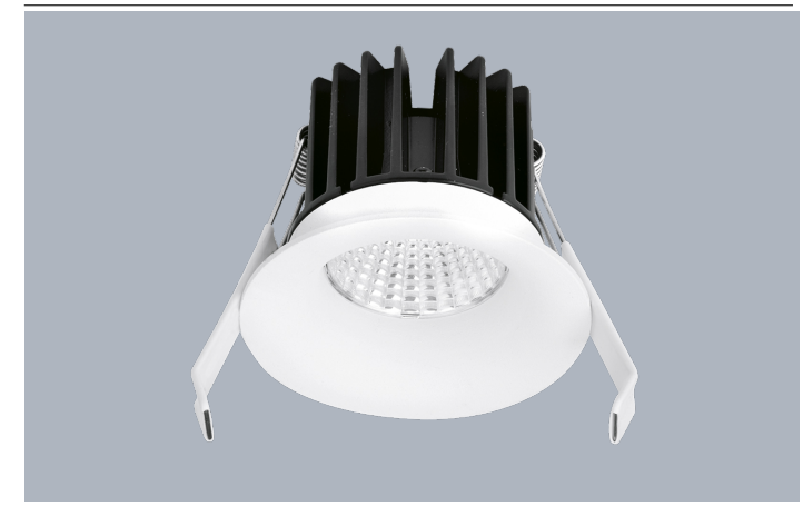
CurveE™ 7W Baffled Dimmable IP44 LED Downlight