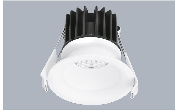
CurveE™ 10W Baffled Dimmable IP44 LED Downlight