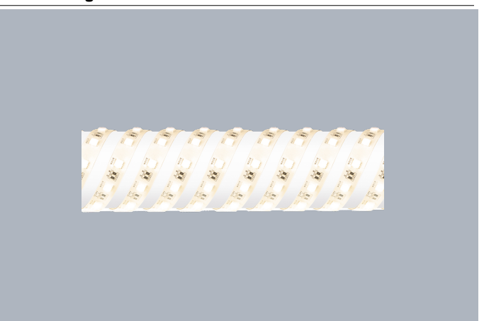
LEDLine<sup>™</sup> PRO IP67 RGBW Flexible Strip