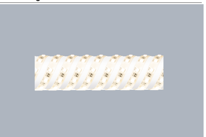
LEDLine<sup>™</sup> PRO IP67 RGBW Flexible Strip