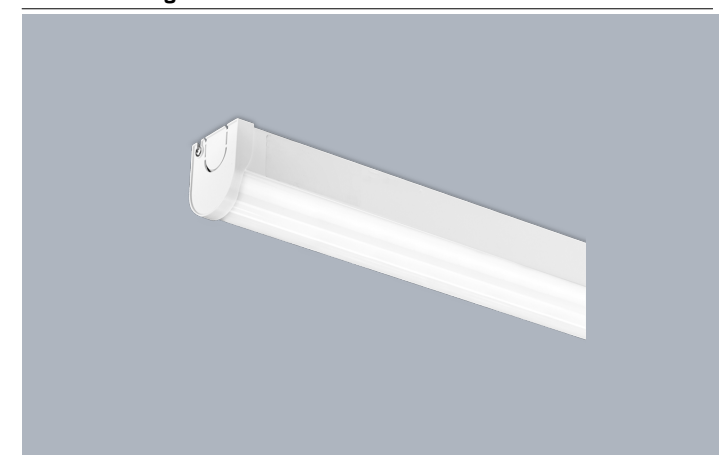
BatPac™ PRO 1200mm 22W LED Batten