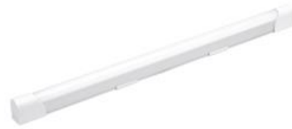
Eco8™ 1500mm 24W Polycarbonate LED Batten