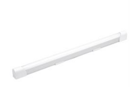
Eco8™ 1500mm 24W Polycarbonate LED Batten