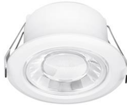
Spryte™ 10W Fixed Integrated IP44 Dimmable LED Downlight