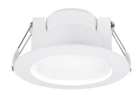
Uni-Fit™ 240V 10W Integrated IP44 Dimmable LED Downlight