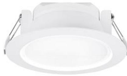
Uni-Fit™ 240V 15W Dimmable Integrated IP44 LED Downlight