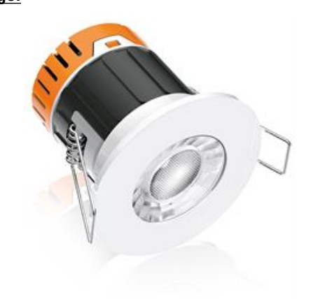
E5™ Fixed 4.5W Dimmable Fire Rated LED Downlight