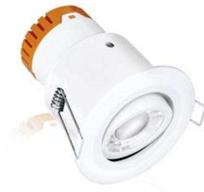
E8™ Adjustable 8W Dimmable Fire Rated LED Downlight