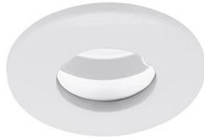
EDLM™ GU10 Cast Aluminium IP65 Downlight