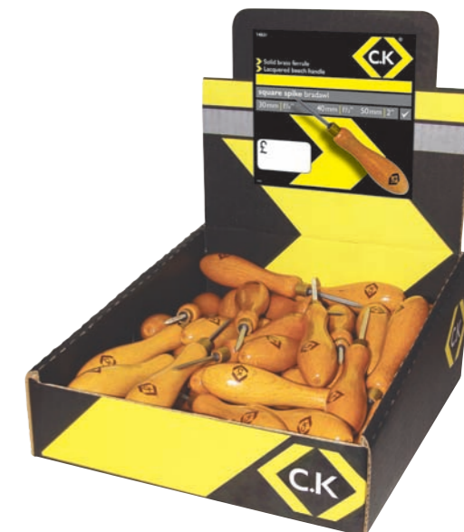
Bradawl display box - 50 Square assorted length