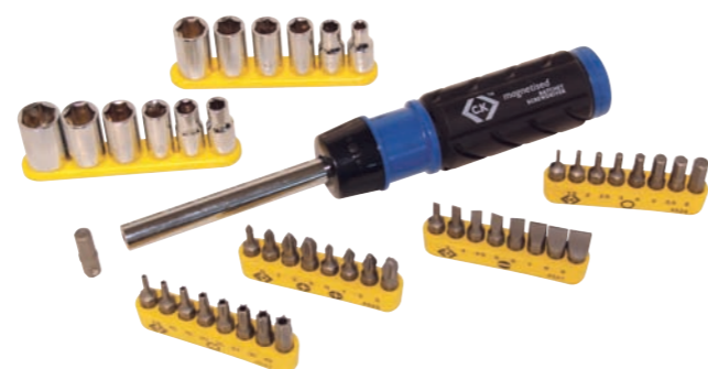
Ratchet screwdriver bit & socket set

CONTENTS: Ratchet driver. 1/4" square drive adapter. Screwdriver bits: 1 x slotted, sizes: 3.0, 4.0, 4.5, 5.0, 6.0, 7.0, 8.0 & 9.0mm. 1 x PH, sizes: 0, 1, 2 & 3. 1 x PZ, sizes: 0, 1, 2 & 3. 1 x hexagon, sizes: 1.5, 2.0, 2.5, 3.0, 4.0, 5.0, 5.5 & 6.0mm. 1 x TX tamperproof, sizes: 8, 10, 15, 20, 25, 27, 30 & 40. Sockets: 1 x metric, sizes: 6, 7, 8, 10, 11 & 13mm. 1 x imperial, sizes: 3/16, 1/4, 5/16, 11/32, 3/8 & 7/16".