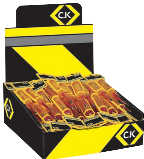
Mainstester display box - 20 Piece 100-250V AC