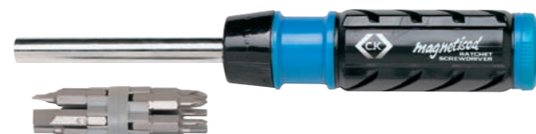
Ratchet screwdriver & bits set

CONTENTS: Ratchet screwdriver. Screwdriver bits: 1 x slotted, sizes: 3.0, 4.7 & 6.3mm. 1 x PH, size: 2. 1 x PZ, sizes: 1, 2 & 3. 1 x hexagon, sizes: 3, 4 & 5mm.