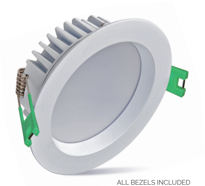
ALL BEZELS INCLUDED