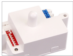
AVAILABLE WITH MICRO-WAVE SENSOR FITTED